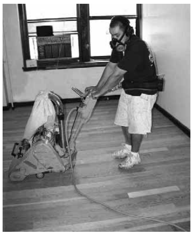
Figure 2. — Sanding of installed flooring. Note air monitoring pump on operator.

A test was performed to determine whether residual lead was present on the surfaces of surrounding equipment. American Society for Testing and Materials Standard E-1728 (ASTM 2002) specifies the use of a wiping cloth to collect settled dust for lead analysis. This method was used to sample the machinery. Total lead was measured in \mu g/m^2 .